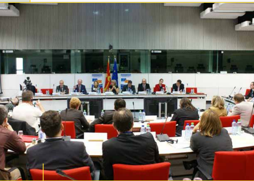
From the inauguration meeting of the Joint Consultative Committee in Brussels

On September 25, 2009 the European Economic and Social Committee (EESC) was host of the first Joint Consultative Committee EU – Republic of Macedonia (JCC), a joint consultative body with the task of monitoring relations between the EU and the Republic of Macedonia from the point of view of civil society. The JCC will promote contacts and discussions between civil society representatives from both sides on issues of common interest.