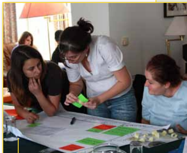
Part of the participants in the training, during practical exercises

As part of the advocacy and lobbying course, the participants went through the stages of identification of the issue or problem to be advocated or lobbied for, objectives, partnerships and alliances to be established, dealing with the power. They also discussed the involvement in the policy making, the process of policy making and at the end they analyzed several policy papers.