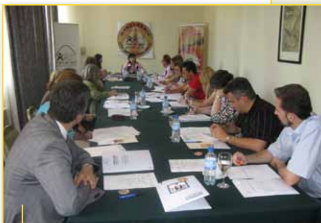
From the Founding Assembly of the Alliance Macedonia Without Discrimination

The founders of the Alliance are Association for Democratic Initiatives, Gostivar; El Hilal, Skopje; Macedonian Center for Women's Rights – Shelter Center, Skopje; Macedonian Center for International Cooperation, Skopje; National Council of Women of Macedonia – SOZM, Skopje; Polio Plus – Movement against Disability, Skopje; First Children's Embassy in the World “Megjashi”, Skopje; Humanitarian and Voluntary Association of Roma “Mesecina”, Gostivar; HOPS – Options for Healthy Life, Skopje; Center for Human Rights and Conflict Resolution, Skopje and the Third Age University, Skopje.