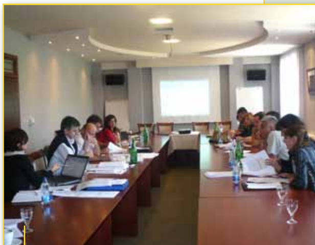
From one of the meetings of the Working Group that prepared the text of the Draft- Law

Apart from implementing the International regulations and practices the new law will be directed towards resolving the daily obstacles and problems in the development of the civil society.