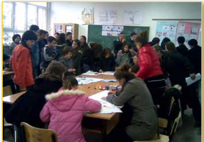
The education classes were accepted with great enthusiasm and attended by huge number of people

At the end of the event all children received gifts.