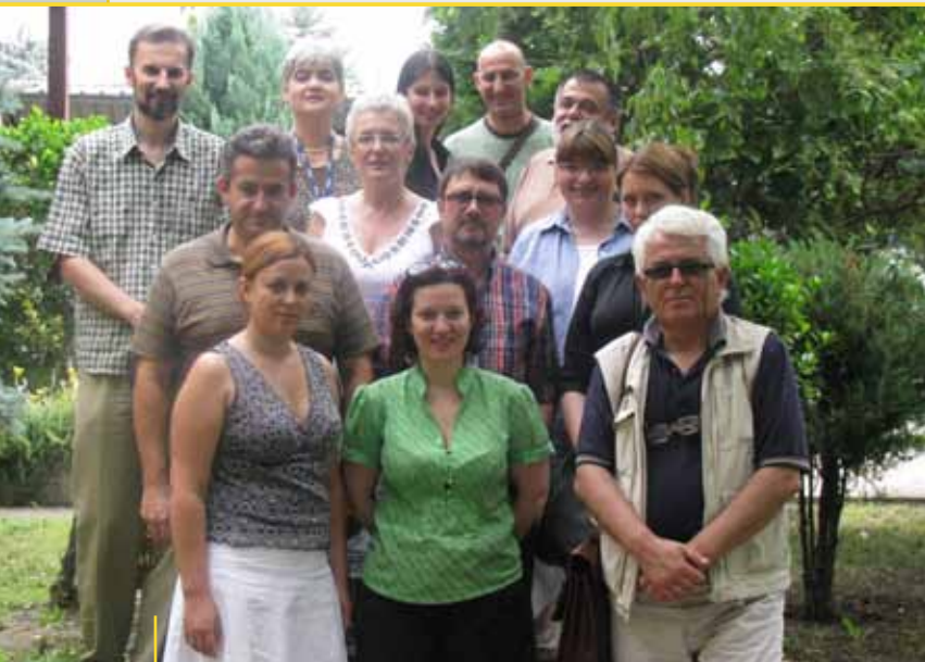
Participants at the Founding Assembly of the Balkan Civil Society Development Network

Eight years after being initiated as a pilot project and over 5 years since its transformation into network, BCSDN has formally become a legal entity with 11 founders civil society organizations. On July 6, the Balkan Civil Society Development Network (BCSDN) held its Founding Assembly in Skopje, Macedonia. The Assembly adopted the main acts, the Statute and the Strategic Orientation 2009-2011 and elected the Council, the Board and the Executive Director.