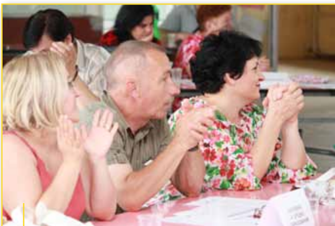
Citizens of Bitola greet the selection of priority projects that will be financed by the program

In the course of 2009, five forum sessions were organized in Resen and in Bitola. The